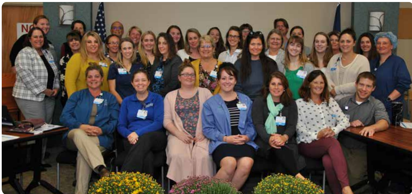
More than 30 nurses gathered for the Clinical Practice Governance day-long retreat held in September.