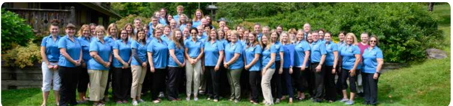
Members of NMC's Management team, including Leadership, at the annual retreat.